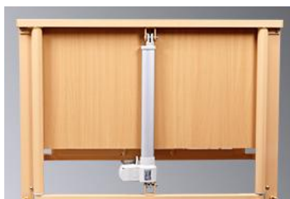
HEAD AND FOOT BOARD

Four \phi 10 cm swivel casters with brakes, easy to move the patient and fixed in any desired position.