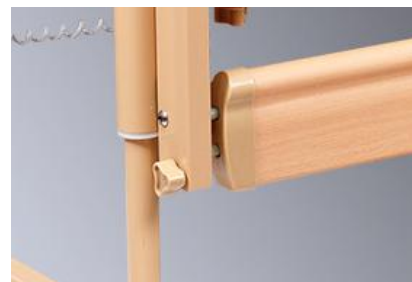
SIDE RAILING STOPPER

Sturdy metal welded platform surface with mattress holder, 4 section board.